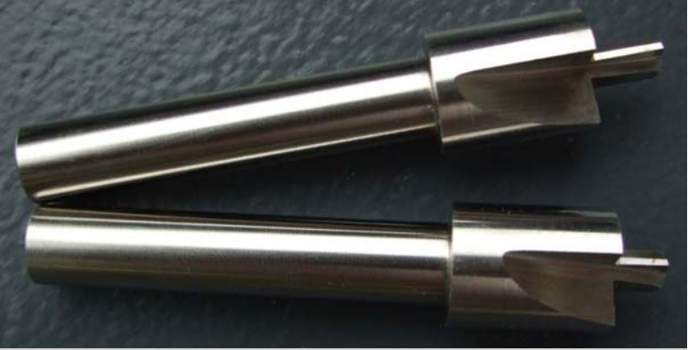
EJOT PT® Stop drill bits Dedicated drill bits to accurately drill stopped holes to the required depth and hole diameter in the high pressure laminate boards to receive the EJOT PTS fasteners to securely install hanging brackets