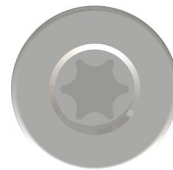
TORX® T25 Recess